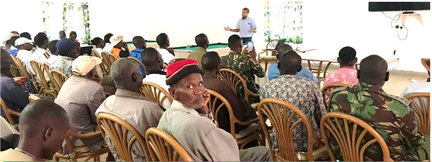
Presentation and discussion about LTWP and its Winds of Change Foundation (WoC)